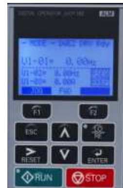
Operator's control panel